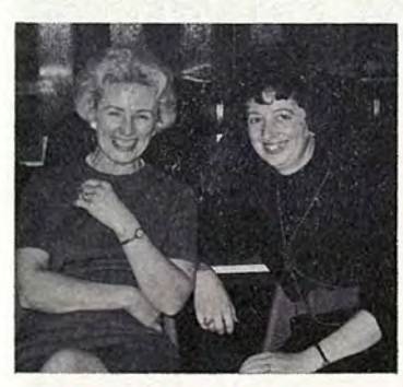
Head Office Delegates to the Meeting