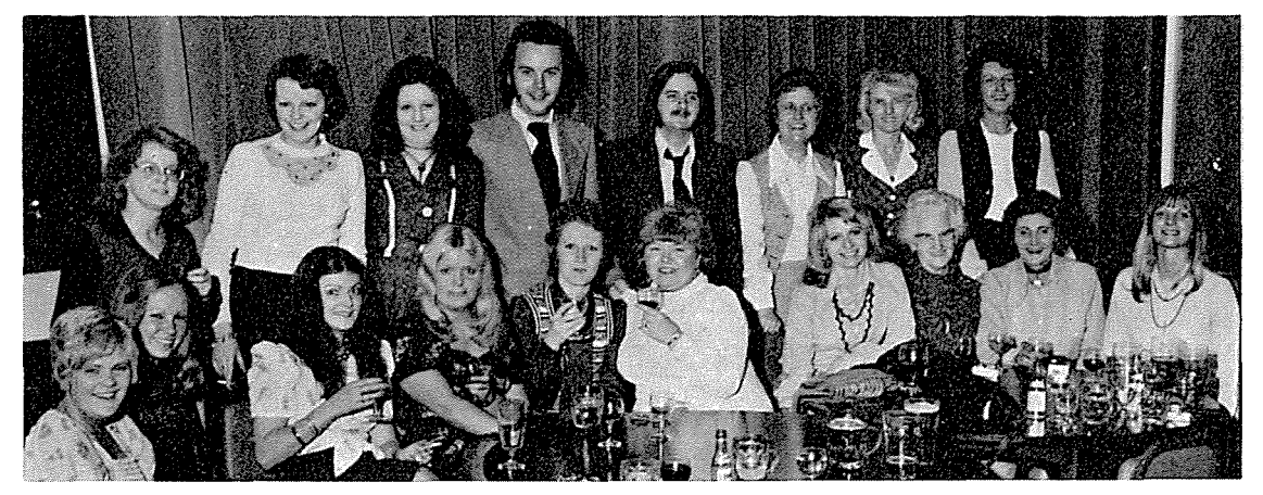
Rhostyllen revellers enjoying the social evening which followed the business part of their annual meeting.

every year," he commented, "We should be allowed to charge the economic price for electricity to all our customers."