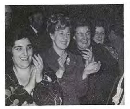
A Maloney anecdote which brought smiles and applause.